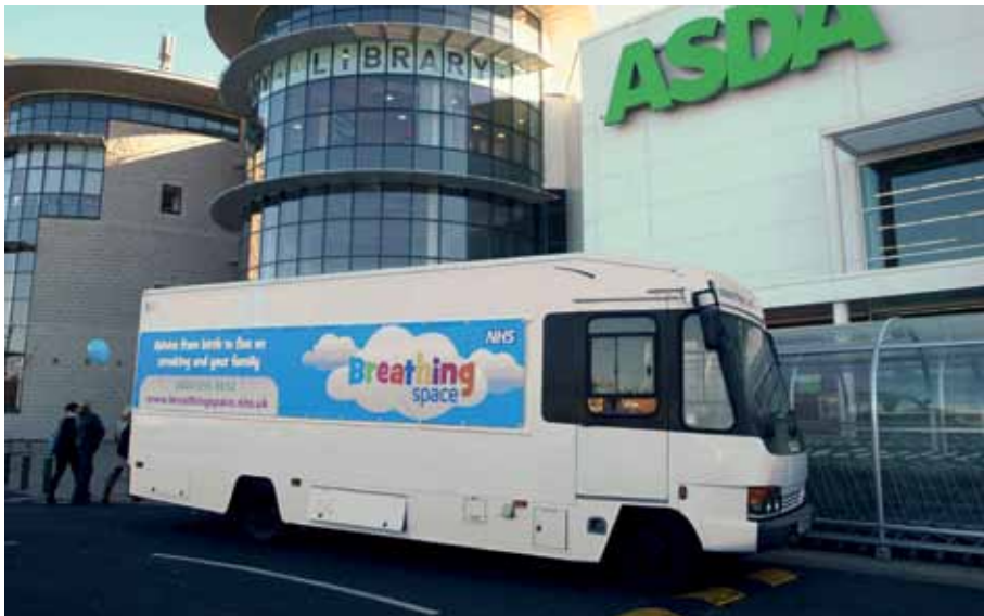
The new Colebridge Bus in action at Asda, Chelmsley Wood

Colebridge Trust owns a large mobile exhibition bus called Suzi to her friends. The bus means you can take your event to your audience rather than hope they turn up at your location. The mobility of The Bus means targeted campaigns and events can move quickly and effortlessly to different audience locations.