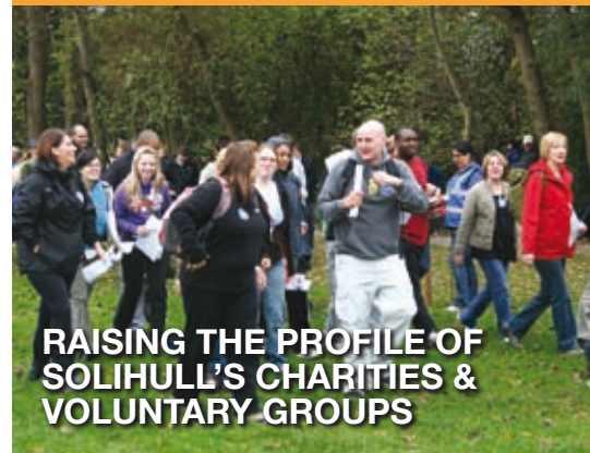
RAISING THE PROFILE OF SOLIHULL'S CHARITIES & VOLUNTARY GROUPS