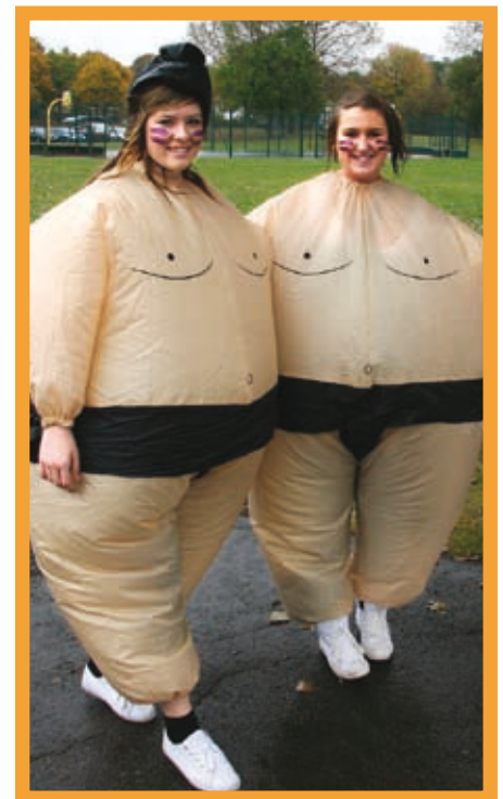
SUMO WRESTLERS FROM GRACE ACADEMY COMPLETE THE SOLIHULL TOGETHER SPONSORED WALK

“Phase two of Solihull Together was about encouraging local companies to do something fun and raise money for the Solihull Together fund.”