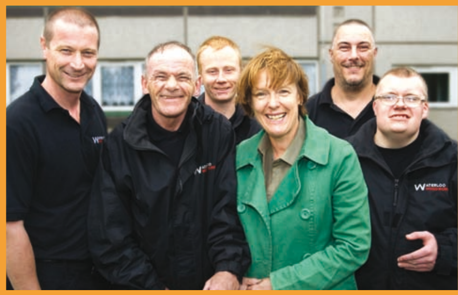
THE WATERLOO WOODWORK TEAM WITH CAROLINE SPELMAN MP, CHAIR OF WELCOME'S CHARITABLE BOARD, AT THE WOODBROOKE GARDEN PROJECT