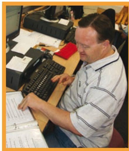
ACCESS IT CLIENT AT HOBS MOAT LIBRARY COMPUTER CLUB